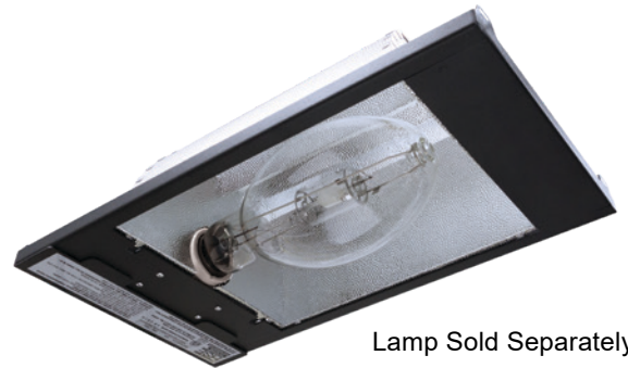
Lamp Sold Separately